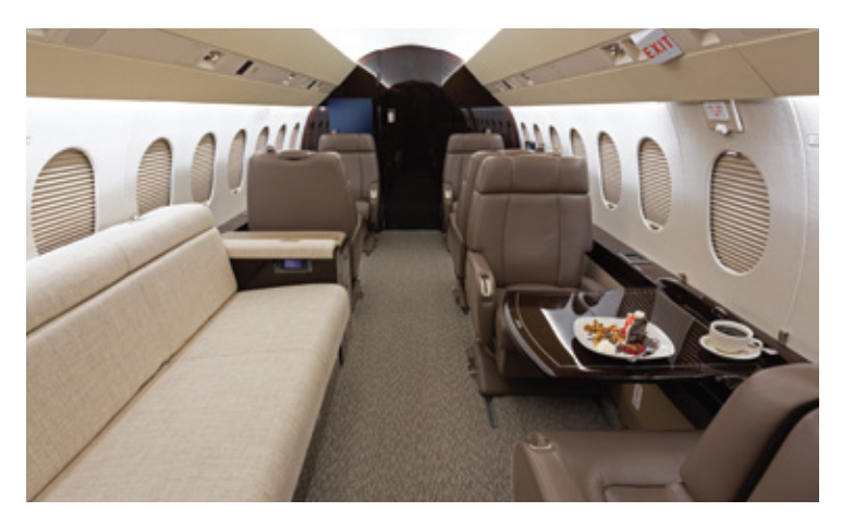
SERVICING GLOBAL DESTINATIONS

The exceptional performance and passenger amenities of the Falcon 2000LX EASy have made it one of the world's most popular large cabin business jets. The interior of this aircraft has recently been masterfully refurbished with no expenses spared. Passengers traveling coast-to-coast or transcontinental will fly in unparalleled comfort.