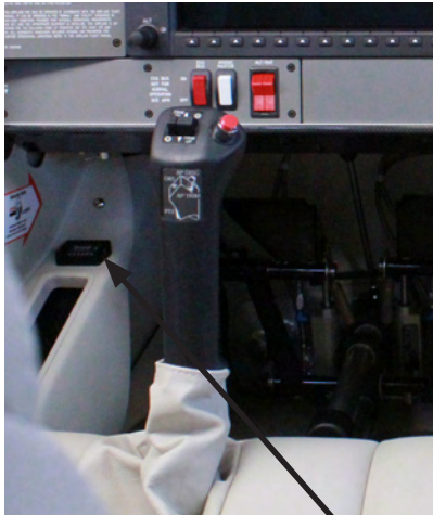
The Hobbs meter is located just ahead of the pilot outboard storage pocket.

The trim panel on the lower edge of the instrument panel is styled in Carbon Weave or Walnut Burl to match the trim wheel cover and other accents, and connects to the center tunnel.