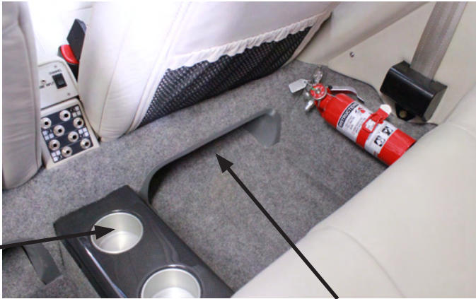
Redesigned footwells allow passengers to stretch out and the MP3 / XM radio jack is conveniently located with the headphone jacks.