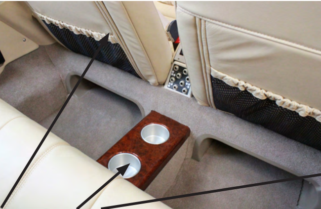
Rear seat pockets hold cell phones and magazines. Cup holders have Walnut Burl or Carbon Weave accents

The trim panel on the lower edge of the instrument panel is styled in Carbon Weave or Walnut Burl to match the trim wheel cover and other accents, and connects to the center tunnel.