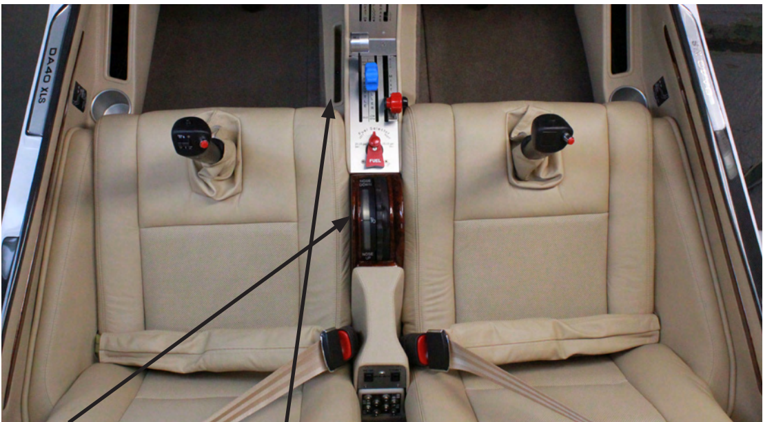
The remolded trim wheel cover and narrowed seat buckle area increases the width of each seat by 1 inch. A mini-pocket on the pilot inboard side panel conveniently stores smart phones or electronic devices.

The lower seat cushions and seat back covers easily remove for cleaning or to be replaced.