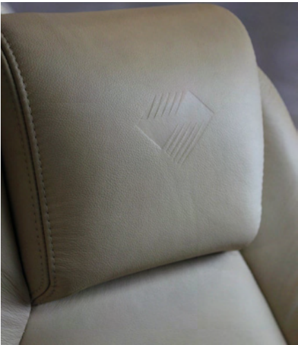
Embossed, padded headrests

Seats have been redesigned for improved lumbar contour.