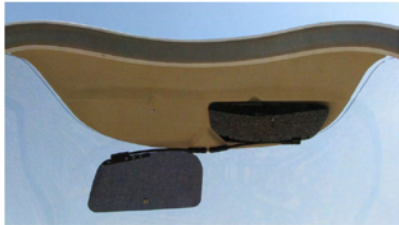
Rosen see-through sunvisors reduce heat and glare.

The lower seat cushions and seat back covers easily remove for cleaning or to be replaced.